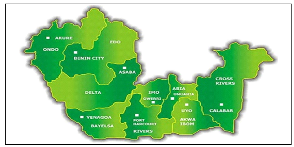
Figure 1: Map showing states in Niger Delta

In attempt to resolves these problems, the region has been accorded some special recognition by the Federal government of Nigeria by establishment of various developmental agencies, among them are Willinks Commission in 1957, the Niger Delta Development Board (NDDB) in 1960; Niger Delta Basin Development Board established in 1965 and Oil Minerals Producing Areas Development Commission (OMPADEC) in 1992. The most recent ones are the establishment of the Niger Delta Development Commission (NDDC) in the year 2000 and the Niger Delta Ministry Commission. All of these are to address the problem of underdevelopment in the Niger Delta (Jack-Akhigbe & Okouwa 2013 and Okumagba & Okereka, 2012), yet these agencies and commissions have failed to leave up to expectation of the people due to several factors such as bad mismanagement, lack of adequate funding, corruption and poor project implementation all which led to underdevelopment in the Niger-Delta (Adesote & Abimbola, 2013; Omotola, Patrick, 2010).