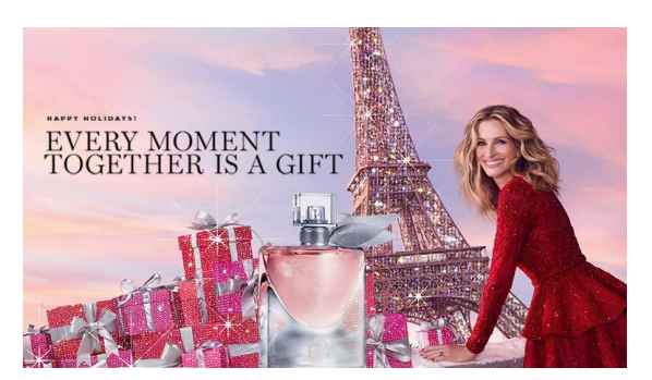
Fig 8: Christmas advertisement of Lancôme, 2020

a gift" has been chosen very successfully.