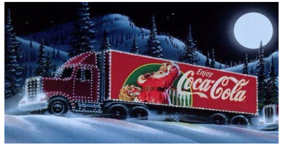
Fig 4: The Coca-Cola Christmas trucks, 1995

image of Santa Claus and featured in more than 30,000 advertisements. The trucks were made more charming with special effects thanks to the company "Industrial Light and Magic", which created the Star Wars and Indiana Jones movies. The trucks helped to introduce Coca-Cola's new Christmas packaging and the images of Santa Claus became famous in the UK, US, Australia, Hong Kong, South Africa, Singapore, and the Philippines. The third year of showing this campaign-1998 was very successful and the advertising was broadcast in more than 100 countries to millions of viewers. It is one of the most used ads in the entire history of marketing.