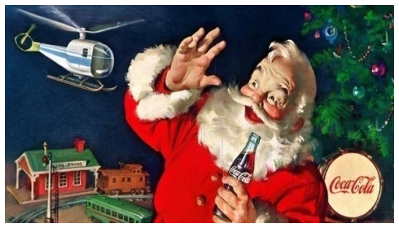
Fig 2: The version of Santa Claus in the Coca-Cola Christmas advertisement, 1964

The Coca-Cola Christmas advertisements are considered to be one of the best ones in the world, reflecting the Christmas spirit and waited for many people. Coca-Cola had the best dayketing strategies even before this notion was created. It is due to this big success and innovative ideas that the company had spread its activity and Christmas advertisement throughout the world, even in the countries where Christmas is not celebrated.