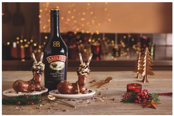
Fig 7: Christmas advertisement of Baileys, 2017

popular One of the most Christmas advertisements and marketing campaigns of the company is the one from 2017. It tells the story of a woman who needs to find clean glasses were to serve Baileys at a holiday gathering. She improvises by cutting the ears off a chocolate reindeer and filling them with Baileys, putting a topping of cream above it. The cups, made by premium chocolatiers Lir, first made their debut at the Baileys advertisement in 2017. However, they proved so popular that they're now available across through supermarket chain Asda in Great Britain.