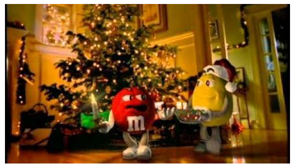
Fig 6: Christmas advertisement of M&M's, 1996

M & M's are multi-coloured chocolate candies. each with the letter "m" printed in small letters in white on one side, having a candy wrapper surrounding a feeling that changes depending on the variety of M&M. The original candies have a semi-sweet chocolate filling, and have gained popularity all over the world. The candy originates from the United States, and M&M's are sold in over 100 countries nowadays. Throughout the years the company has had very successful marketing campaigns, starting mostly after 1982. M&M's most popular Christmas campaign was in 1996. It was so successful due to the idea in the story it tells the wise candies who can speak, offer a bowl (special holiday edition) of M & M's to Santa Claus, and are surprised to discover that "he exists". Thanks to the effective use of humor in the advertising, it has stood the test of time and even inspired a sequel 21 years later.