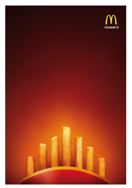
Fig 10: Christmas advertisement of McDonald's, 2008

As mentioned before, the Christmas holidays nowadays are traveling beyond the borders of the Christian world. An example of this is the McDonald's Christmas campaign from 2008 where they used its famous French fries to recreate a Hanukkah menorah in Israel. To show creativity and respect to the Christmas spirit and holidays of the different nations, McDonald's designed in-store posters using actual McDonald's products to create images that are related to the festive season in different countries and religions.