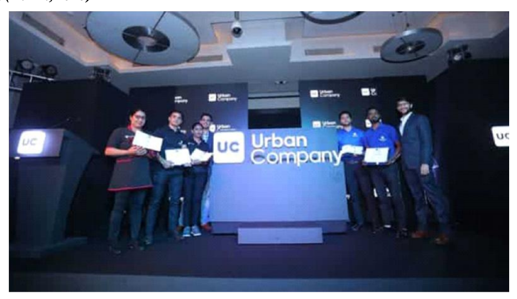
Exhibit 2: Urban Clap is now Urban Company